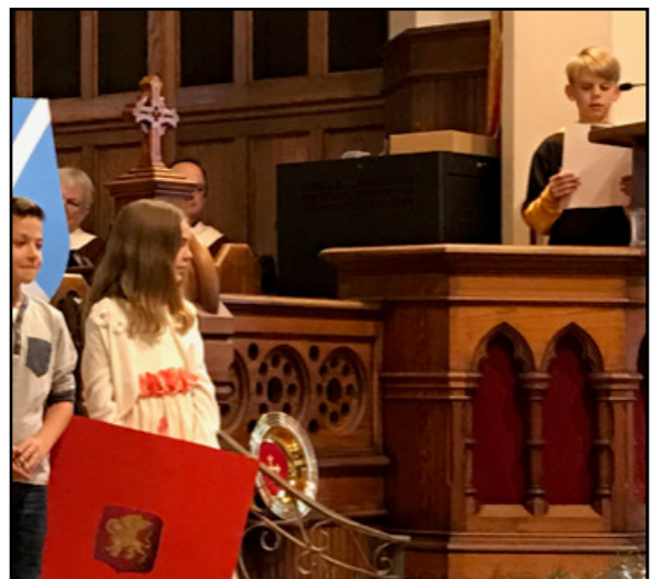
All Saints Day