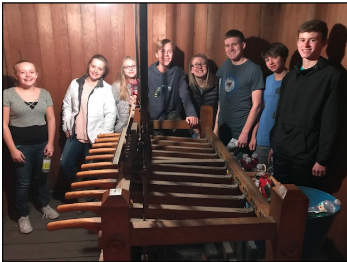
Tour the Tower hosts

Director of Children's and Youth Ministries