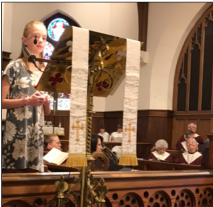
All Saints Day