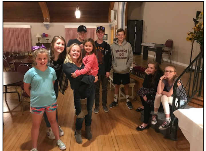
Meal servers for Family Promise